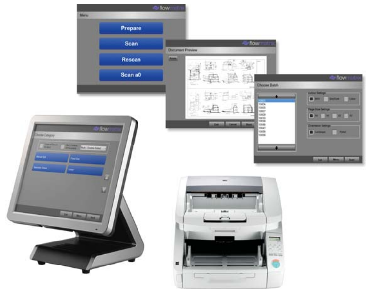
FlowMatrix ScanPort touchscreen batch processing interface with 'minimum-click' operation

The solution has been designed so that mailroom users can easily share the workload by switching roles very easily with full process audit from point of capture through to delivery into electronic content or EDRMS. In addition final decision making for documents and indexing can be deferred to a remote department or user using their own QuickDrop desktop client connected to the same queue-based management as the mail room.